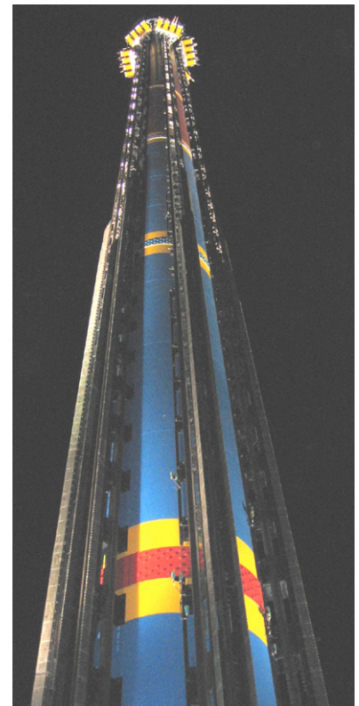
SUPERMAN Tower of Power